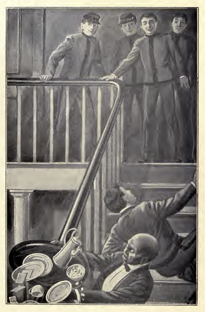
CRASH! CAME SOBBER INTO THE TRAY.—Page 96. The Rover Boys on the Farm.